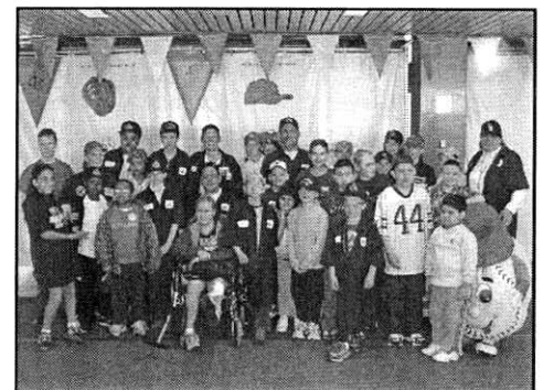
The winning "Wings" baseball team.

Additional photos of the Dream Flite are at http://ord.aa.com