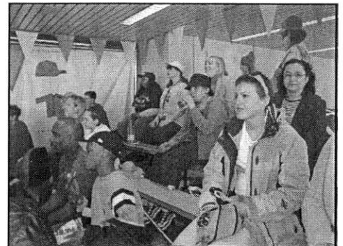
Spectators cheer on the "Wings" team